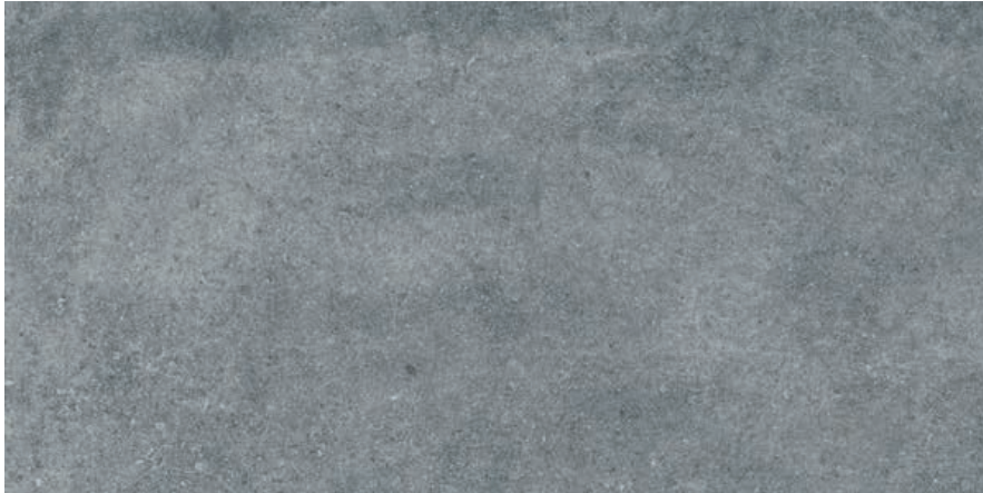
NERO Matte Finish 30 x 60 cm (11.811" x 23.62") ZC.BN.NRO.1224.MT