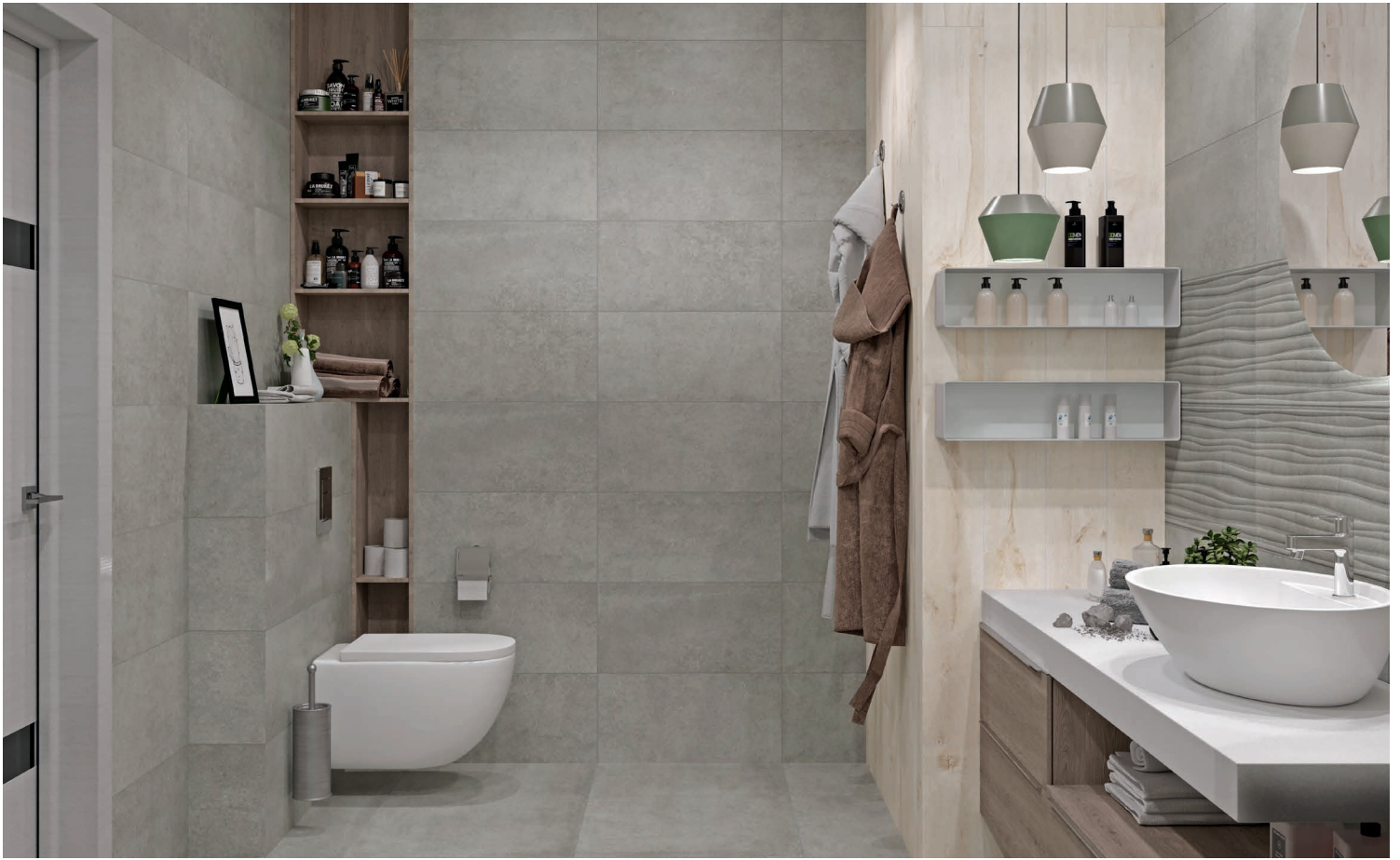
GRIGIO Matte & Structured